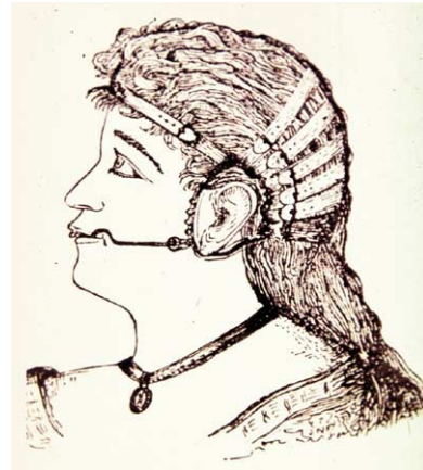
Fig 5. Farrar was among first to use occipital anchorage to retract anterior teeth.

Also contrary to Angle, Case used a different type of appliance for each patient and stressed facial esthetics in contrast to Angle’s reliance on occlusion. He advocated changing the name of the specialty to “facial orthopedia.”